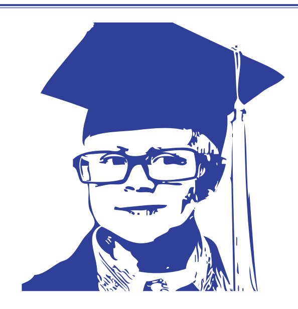
It is much more common to be agifted child than to be an adult creative genius.

Don't assume that all gifted children are the same – a mathematically gifted child needs something very different from a verbally gifted child.